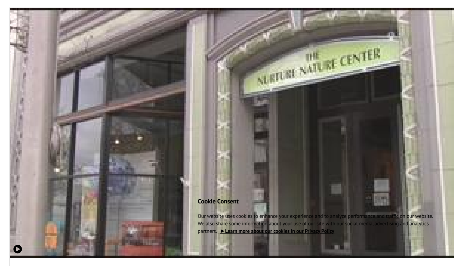
Easton's Nurture Nature Center has vision for the former Easton Iron & Metal site

The closures will only happen at times when the construction crews are moving materials that are too wide to allow for two-way traffic to pass by safely and will not require any business closures. The project is expected to last up to 13 weeks. MORE INFORMATION