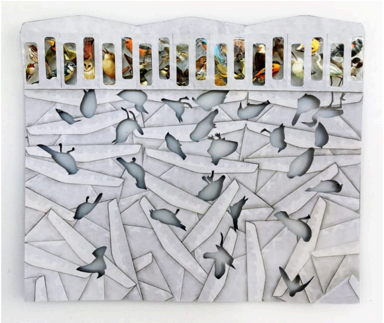
Kate Dodd, Migrants, 24" x 30", 2020, repurposed envelopes and collage with graphite

our time with the intention of offering different ways to effect change and mend the significant damage that we have caused to the Earth. The artists' responses to the essays form the exhibition Climate Conversations: All We Can Save . The exhibition runs through June 30 th , 2022.